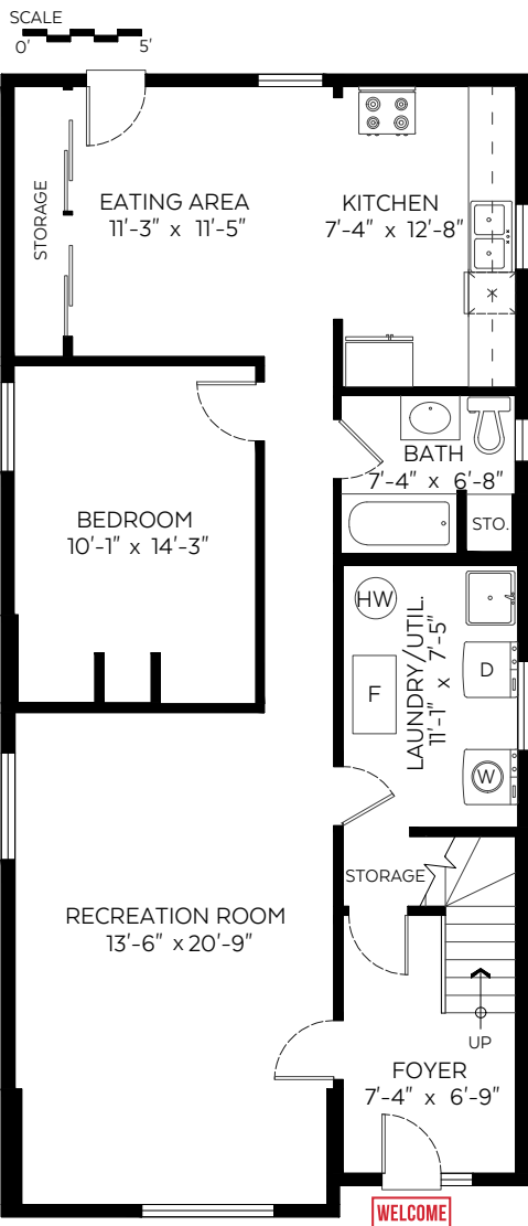
Lower Floor Plan Floor Area: 1,069 sq.ft.