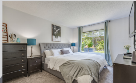
Large master bedroom suite