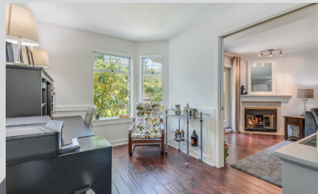
Generously sized second bedroom