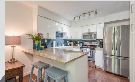
Quartz island, perfect for entertainers