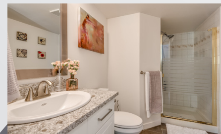
Tastefully updated spa-like bathrooms