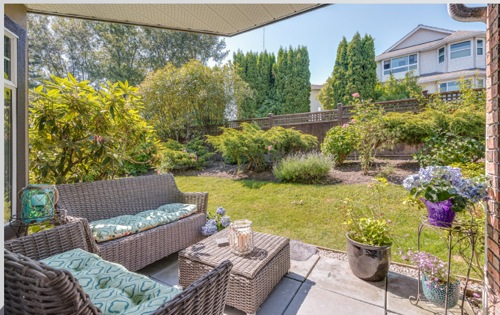
Enjoy evenings on a huge covered patio