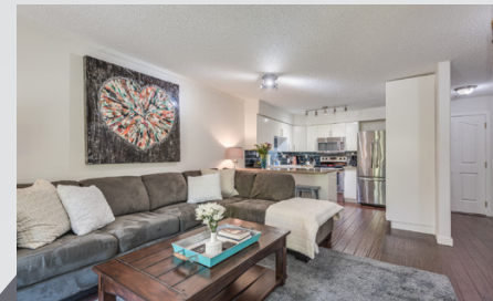
Well laid out open concept living