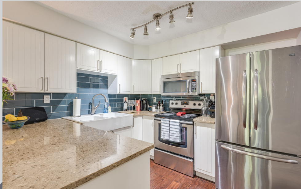
Spacious kitchen with stainless steel appliances and plenty of cabinets opens to living area