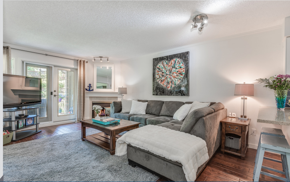
Bright living area features contemporary flooring and access to patio