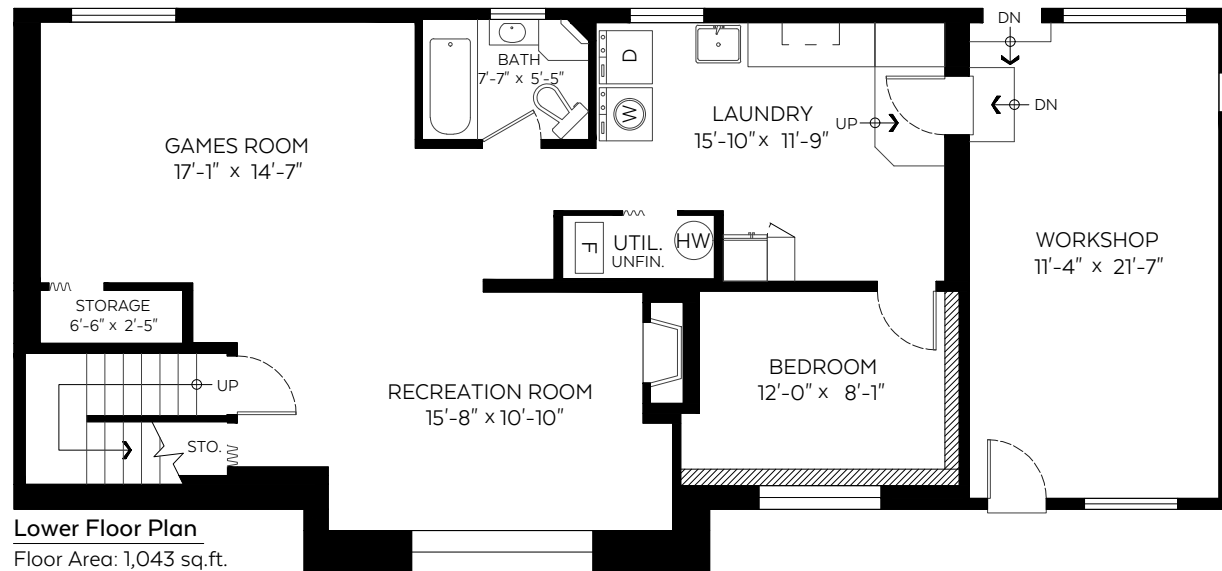
Lower Floor Plan Floor Area: 1,043 sq.ft.