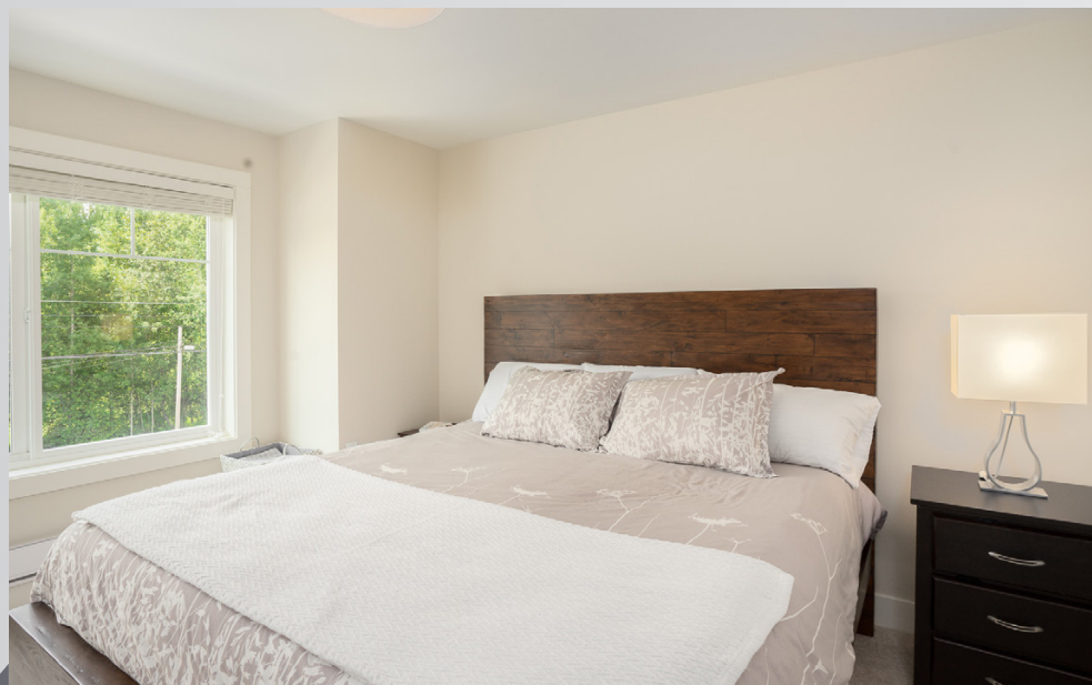
Master bedroom suite with ample windows and ensuite