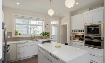
Plenty of natural light throughout