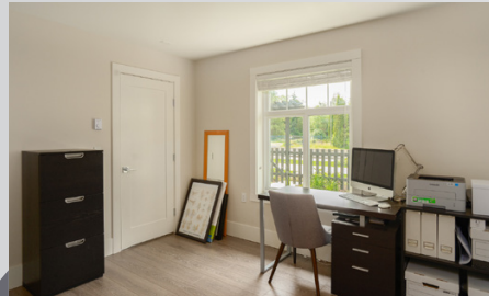
Generously sized flex room