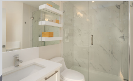
Spa inspired bathrooms