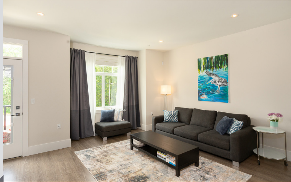
Bright living area features contemporary flooring and access to patio