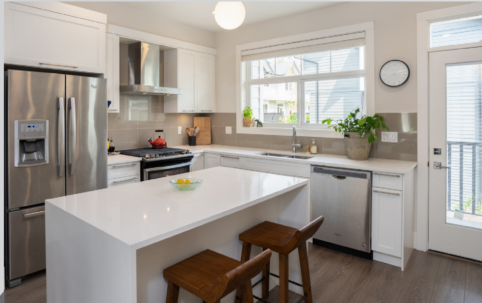
Spacious kitchen features island, perfect for entertainers and families