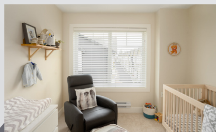
Perfect for families