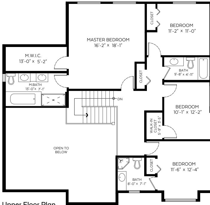
Upper Floor Plan Floor Area: 1,299 sq.ft

*NO ACCESS FOR MEASUREMENT. BUYERS TO VERIFY.