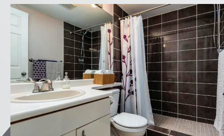
Updated walk-in shower