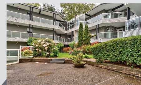
Well kept building