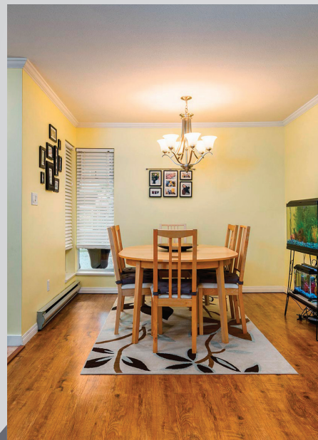
Dining space is perfect for entertainers