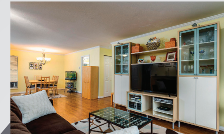
Feels like a house