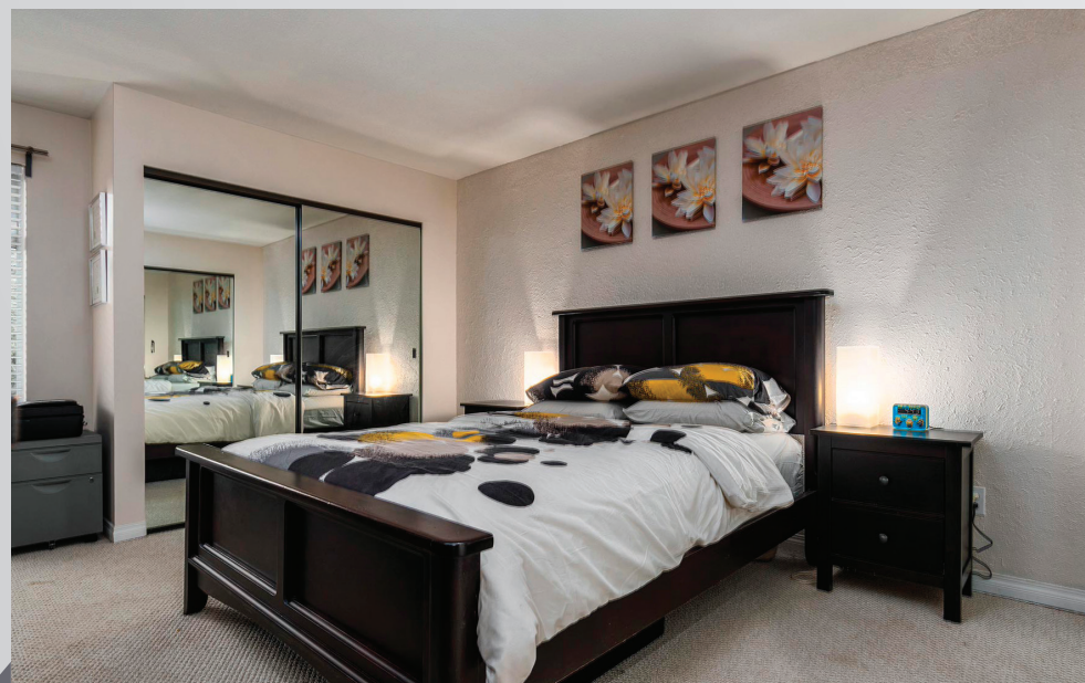
Large master bedroom