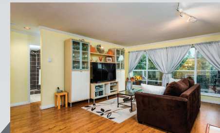
Plenty of natural light