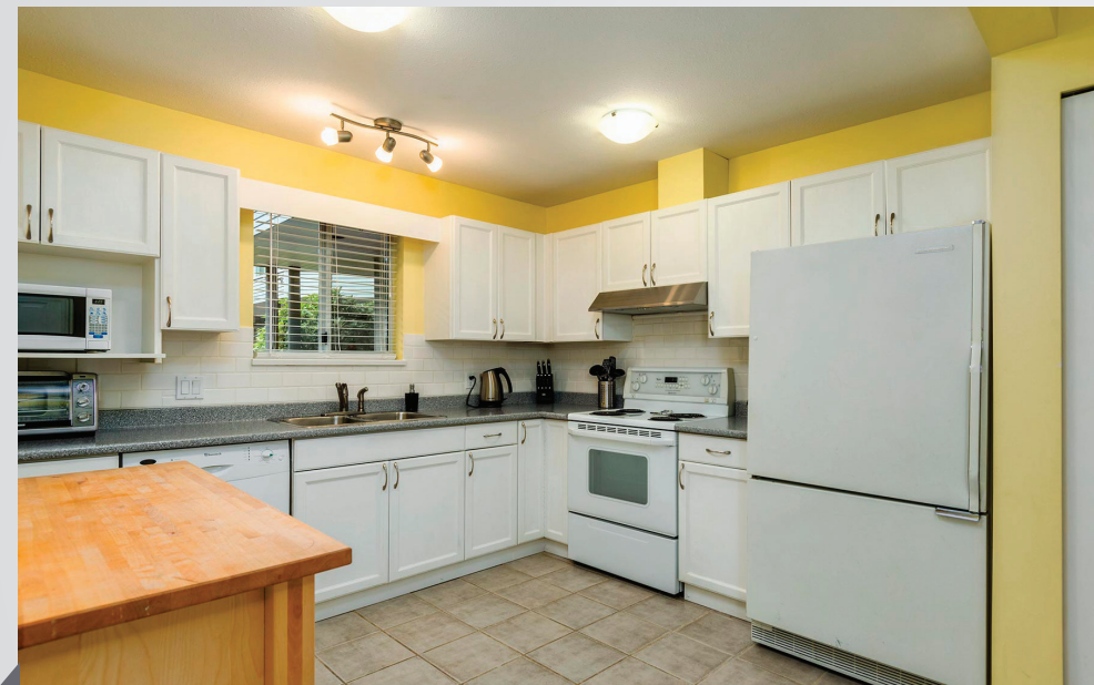
Kitchen features open area and island