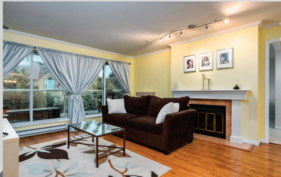
Living room features laminate floors and fireplace

For more information please call Tim at 604 319 4700