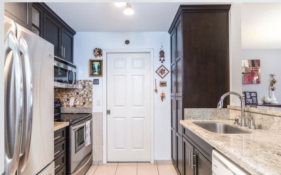
New kitchen with real wood cabinets, granite counters & stainless steel appliances