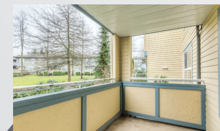
Nice sized deck backs onto park