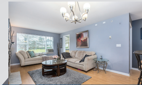
Plenty of natural light

For more information please call Tim at 604 319 4700