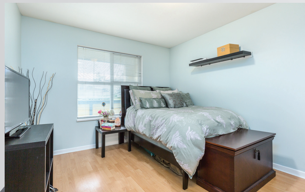
Large bedroom with plenty of natural light