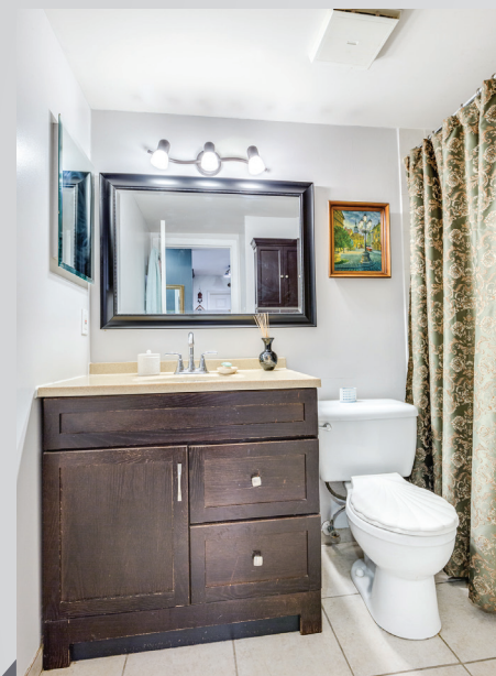
Chic and modern bathroom