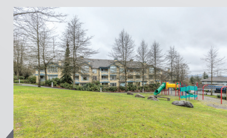
Great community feel