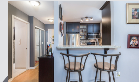
Very efficient use of space