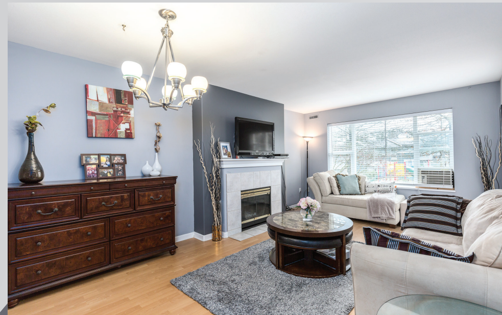
Newer laminate flooring throughout with in floor radiant heat